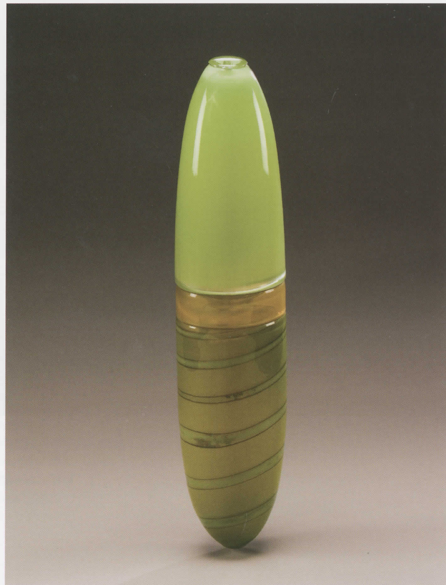
PLATE 85 Lynda Benglis American, born 1941 Tacpere Maptom , 1985 glass 22 x 5 1/2 (diam.) in.